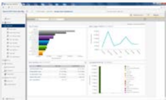
Heavy Users Dashboard