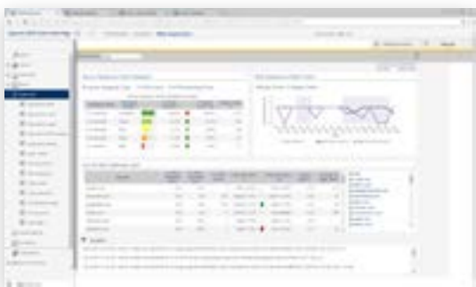
User Quality of Experience Dashboard